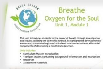
Posted our first developed curriculum