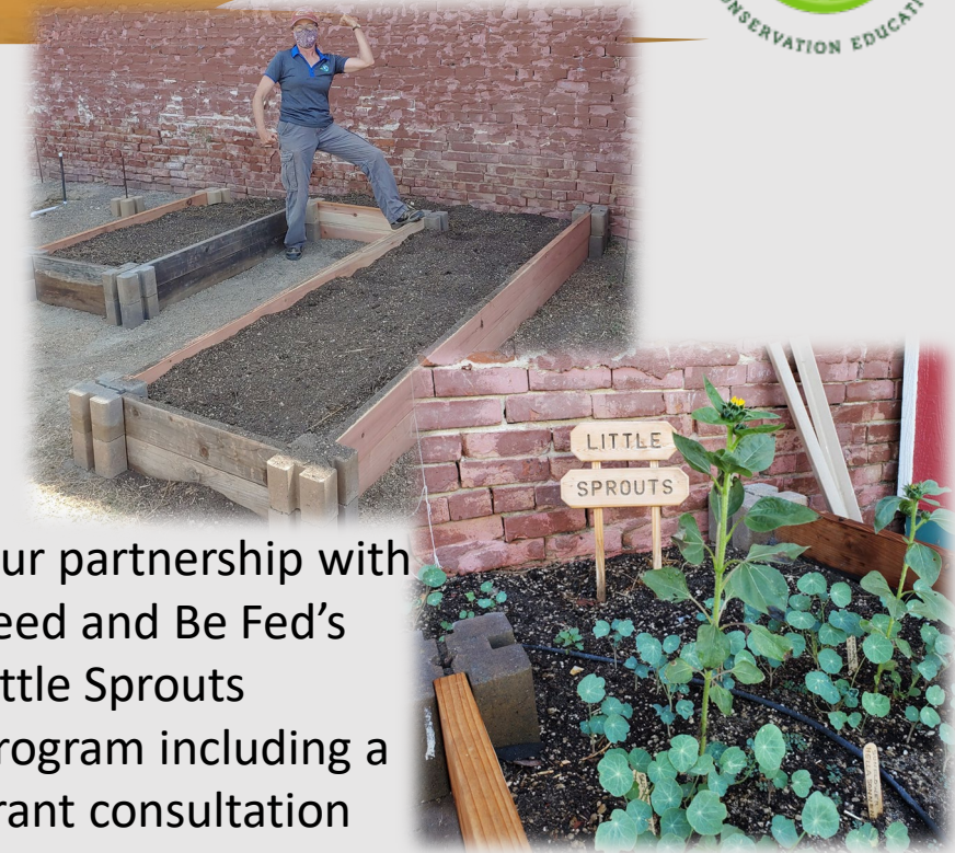
Our partnership with Feed and Be Fed's Little Sprouts program including a grant consultation

Help us continue our work. Support GDCE today to become involved in a new conservation education revolution!