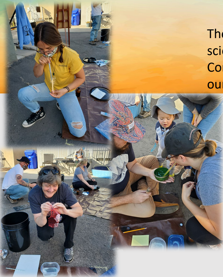
Our first Science Revival Workshop